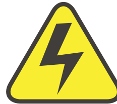
Risk of Electric Shock Risk of severe electric shock