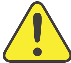
Warning, Danger or Caution Risk of Personal Injury

The symbols below are used throughout this manual to identify important safety information. Heed all warnings and safety information.