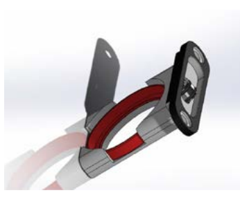
Gobo positioning wheel