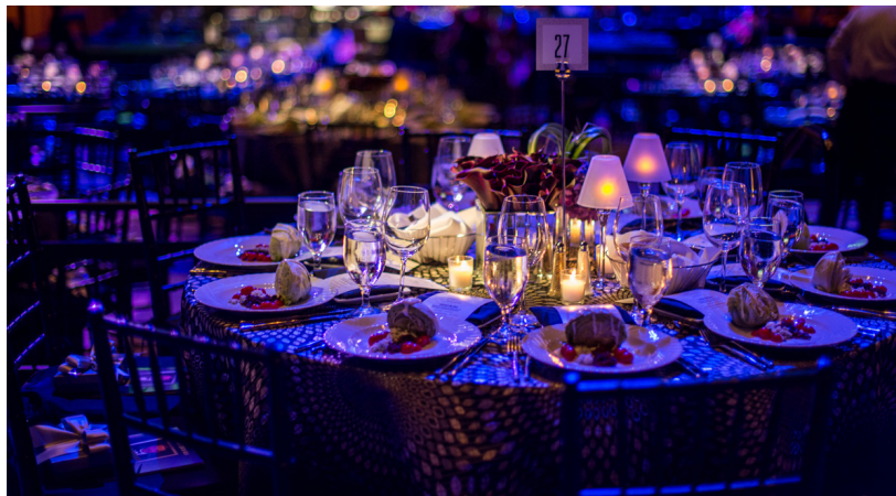
The inspirational table linens at the Adrienne Arsht Center for the Performing Arts Gala

The inspiration for our “Crawford Leaf” pattern came from the linens that were used on the tables. The fabric had an integrated pattern that had a little spiral, a little inversion and just a kiss of Islamic styling.